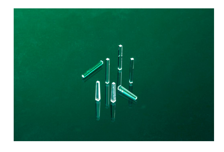
Figure 1: IRD has produced thousands of straight and tapered homogenizers of various shapes and sizes.

Customers continue to push the precision optics manufacturing envelope, demanding higher and higher performance. The power available from industrial lasers is increasing, instrumentation is becoming more compact, medical devices are shrinking to become less invasive, and electronics are becoming ever smaller.